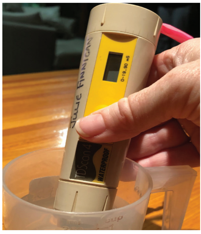
Figure 4: Hand-held conductivity meter