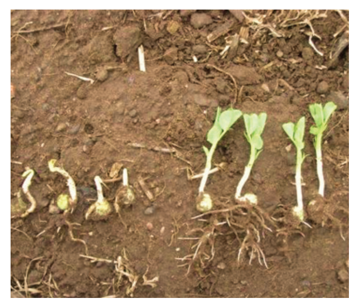
Figure 1: Stunted crop growth

Avoid bare ground as much as possible to reduce loss of organic carbon and nitrogen through volatilisation and erosion. Leaving a saline soil fallow can increase salinity if evaporation of water from the soil is leaving salts behind. A cover crop can help to avoid this.