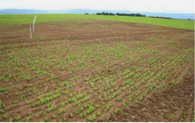
Figure 2: Bare area in new crop growth (salt scald)