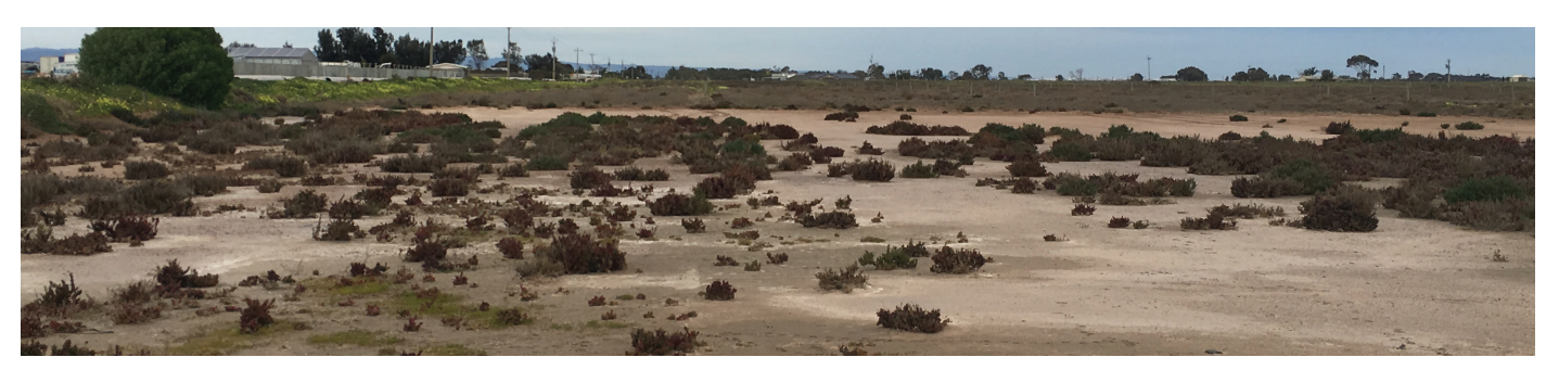
Figure 6: Typical area affected by salinity in the North Adelaide Plains

Salinity in water, e.g. in bore water where salt deposits occur somewhere in the profile, is naturally occurring. Saline dam water can be induced through land use change described above and in dry years due to evaporation and lack of freshwater influx. Wastewater is usually saline.