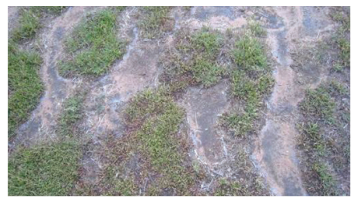
Figure 3: Salt crusting